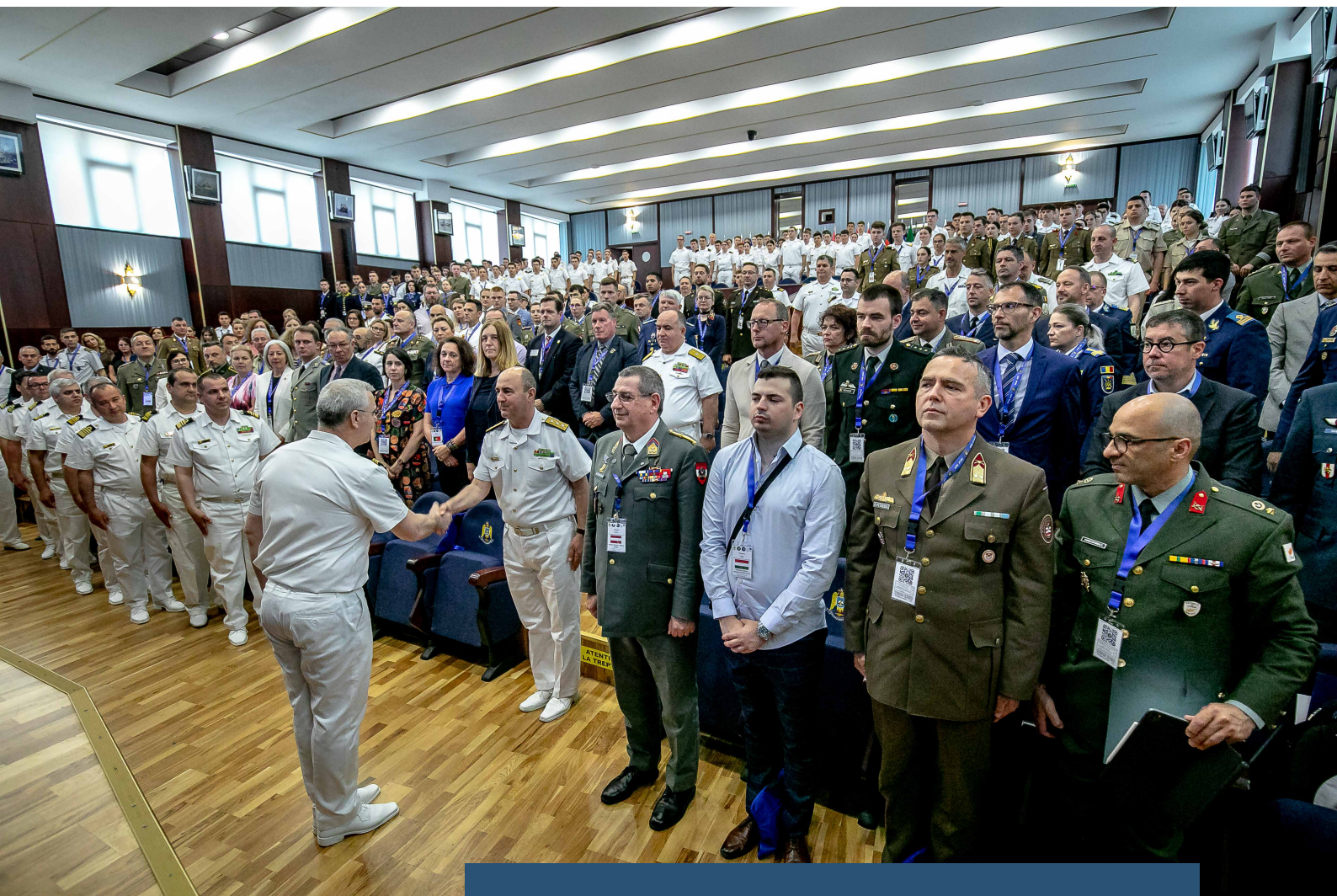
66th EMILYO Implementation Group Meeting and the International Military Academic Forum 2025, held at the 'Mircea cel Bătrân' Naval Academy in Constanța 2-6, June 2025.