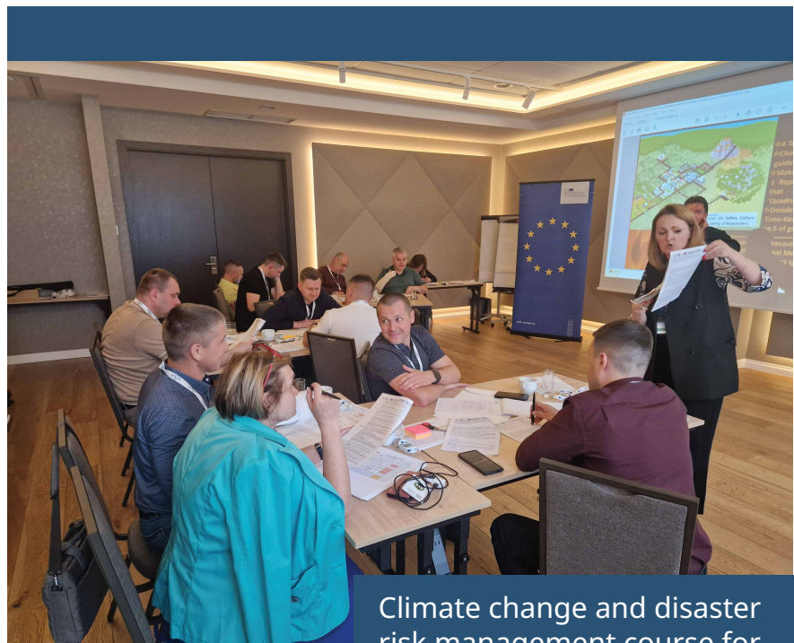
Climate change and disaster risk management course for the State Emergency Service of Ukraine, Rzeszow, Poland

Reflecting the EU's growing emphasis on horizontal crisis management and cross-sectoral preparedness, the configuration increasingly acted as a convenor, connecting EU-led and Member States' initiatives aimed at strengthening long-term resilience. Bridging policy, practice and research communities and mapping potential linkages have become central to its approach. Training activities conducted jointly with diverse partners ensured alignment and promoted a